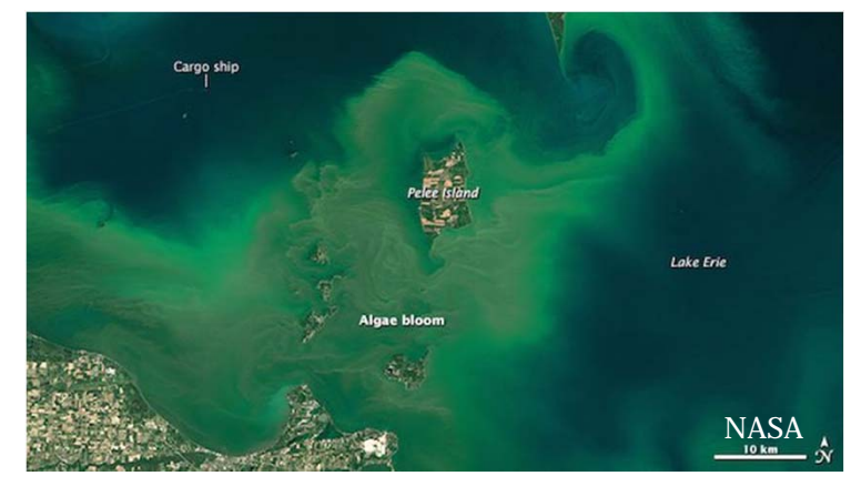
Toxic algae threatens Lake Eric drinking water - Cleveland.com